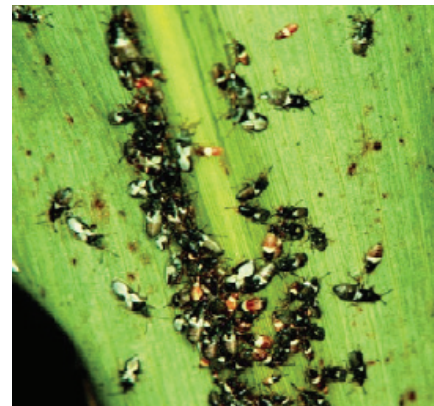
Chinch bugs reproduce quickly in hot, dry conditions. 1

Turfgrass damaged by chinch bugs often recovers if there is sufficient moisture available. Light fertility and regular irrigation will speed recovery from feeding damage.