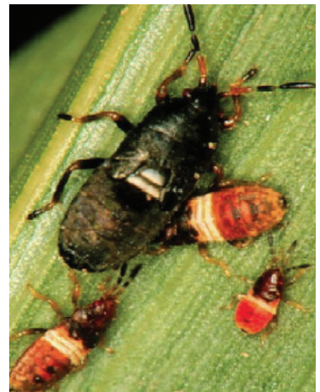
Chinch bugs prefer to feed in full sun. 1