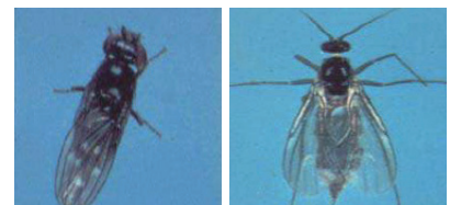
Adult shore fly (left) and adult fungus gnat (right). 1