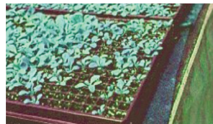
Shore fly habitat. 2

Adult and larvae feed on microscopic algae, dinoflagellates, bacteria, cyanobacteria, and other unicellular organisms. Shore flies are considered a nuisance pest because they leave frass deposits or fly specks on plant leaves, but also can vector several soil-borne diseases including black root rot. Larvae acquire disease by ingesting fungal spores when they feed, which are retained through pupation. When the adult excrete onto plant leaves or the growing medium, their v may contain viable fungal spores. In rare cases, frass can build up and cause growth retardation in young cuttings. Flies present in vast numbers also can become an irritation for nursery workers.