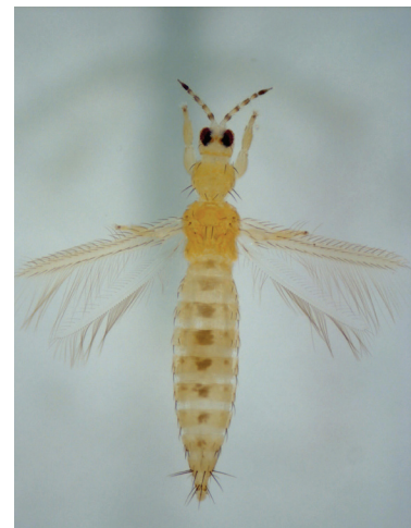
Adult western flower thrips. 1

Nemasys quickly controls larval stages of fungus gnats ( Bradysia spp.), and the adult and pupal stages of western flower thrips ( Frankliniella occidentalis ). When applied to the soil, Nemasys will provide prolonged protection against pest re-infestation. Nemasys is ideally suited for use in integrated pest management programs as an important tool for resistance management, worker safety and environmental responsibility.