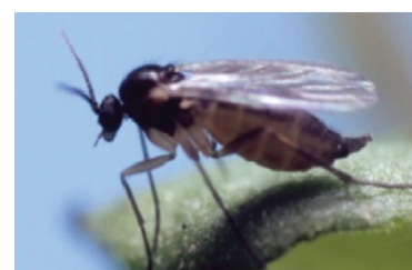
Adult fungus gnat.