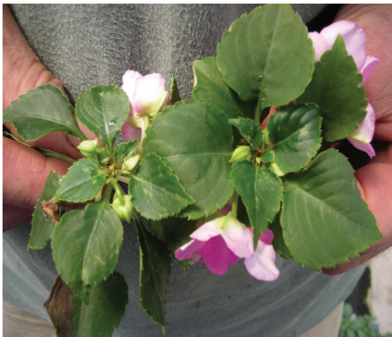
Plant with fungus gnat damage (left) and a healthy plant treated with Nemasys® (right).

Monitoring greenhouse areas for fungus gnat infestations is important because early detection is key to maximize control of the pest. Monitor adults with yellow sticky cards placed horizontally at the soil surface or vertically just above the canopy. To monitor larvae, place potato slices (25 mm thick) on the surface of the soil. Check and replace the slices weekly recording the numbers of larvae found on the potato slices and on the soil just beneath the slices. Tolerance levels will depend on the crop and stage of growth; contact your local extension agent for tolerance levels